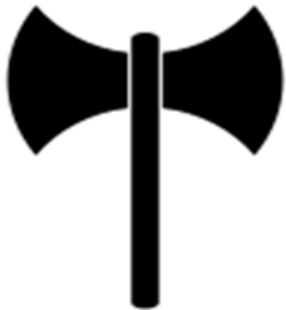
Represents lesbian and feminist strength and self- sufficiency