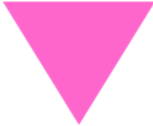
Identification for homosexual men