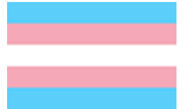
Transgender Pride Flag: Identifies the transgendered community