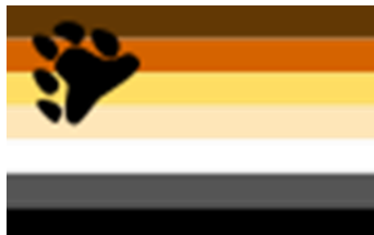
International Bear Brotherhood Flag: Represents the Bear subculture in the LGBT community