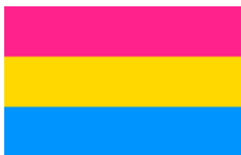
Pansexual Pride Flag: Identifies those that are attracted to people of all genders and sexes