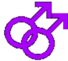
Represents male homosexuality