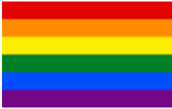
Rainbow Flag: Represents the diversity of gays and lesbians around the world

The LGBT community has adopted many symbols for self-identification and to demonstrate unity, pride, shared values, and alliance to one another.