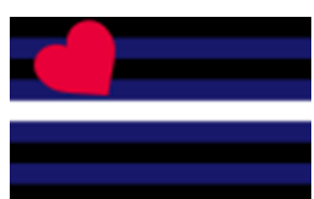
Leather Pride Flag: Denotes practices and styles of dress organized around sexual activities and eroticism