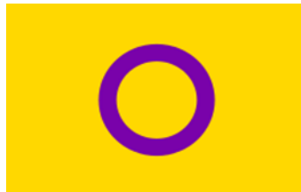
Intersex Flag: Identifies those who do not exhibit all the biological characteristics of male or female, or exhibit a combination of characteristics at birth