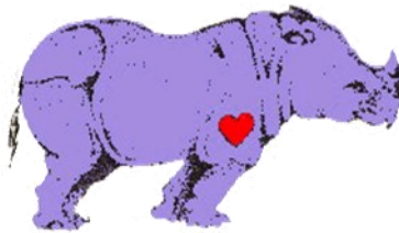
Represents gay activism