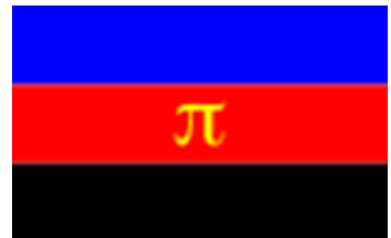
Polyamory Flag: Identifies those with more than one partner