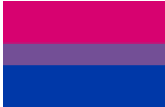
Bisexual Pride Flag: Denotes bisexuality and bi pride