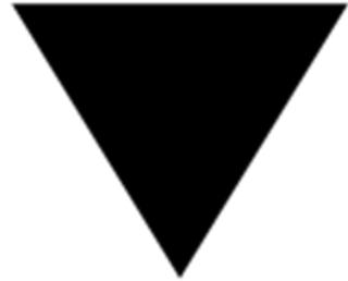
Identification for lesbians