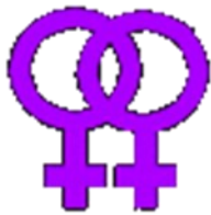
Represents female homosexuality